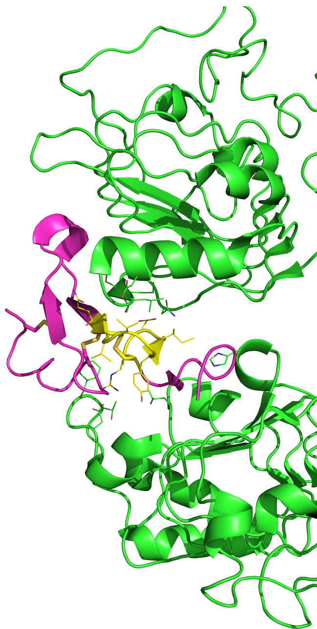
Additional file 1: Figure S2: Three-dimensional structure of the EGF-EGFR interaction. The EGF receptor is in green and EGF is in pink, with the CVVGYIGERC cyclic peptide segment of EGF highlighted in yellow. The cyclic peptide side chains are shown, along with interacting 147 EGFR side chains (those within 4Å of the cyclic peptide).