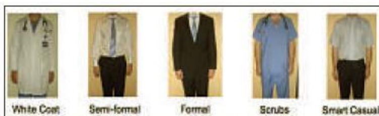
Figure 1 Standardised series of five photographs featuring the white coat, semi-formal attire, formal attire, scrubs and smart casual attire

One hundred and five patients agreed to participate, 53 in the urban centre and 52 in the rural centre. The questionnaires of six participants were excluded from analysis due to incomplete information. No significant differences, in terms of gender distribution or age, were demonstrated between the centres.