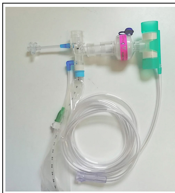
Fig.1: Alternate to Kelly circuit for spontaneously breathing patients. It comprises of Swedish Nose, HME filter and closed suction unit.

We reviewed the availability of all necessary equipment and scrutinised the steps as per the checklist and our organisational guidelines beforehand.